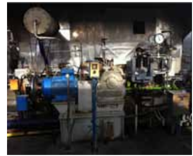
System After Upgrade